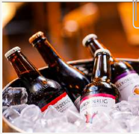
BRIGHT CIDER LIFE