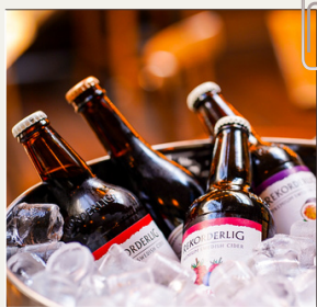
BRIGHT CIDER LIFE